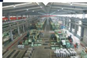
STAINLESS STEEL PRODUCTS