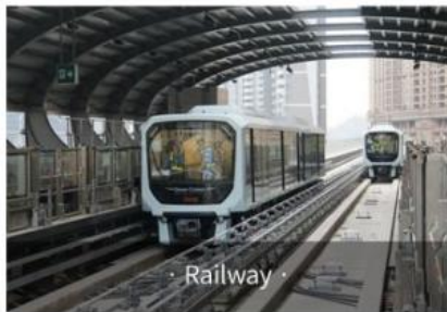
· Railway ·