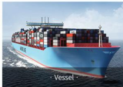
· Vessel ·