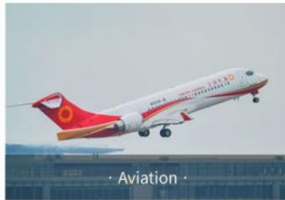
· Aviation ·