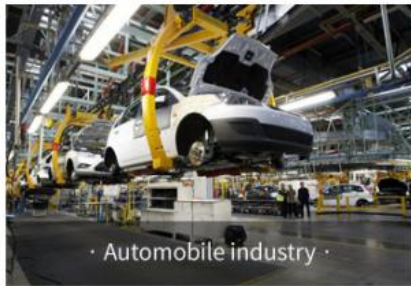
· Automobile industry ·